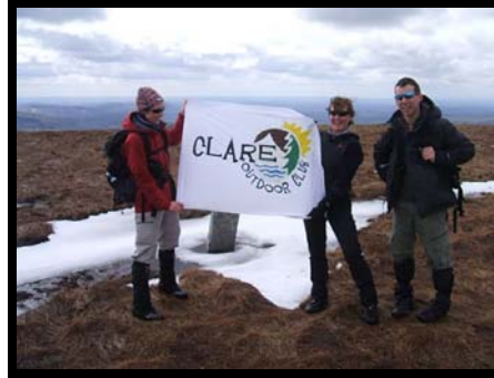
Lobawn – in the bag!

Conquering the sublime, mythical Lobawn was,