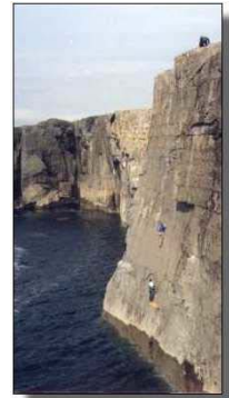
Climbing at Ailladie

This month, we're starting a series of short articles on aspects of the environment that will be of interest to anybody who enjoys the outdoors.