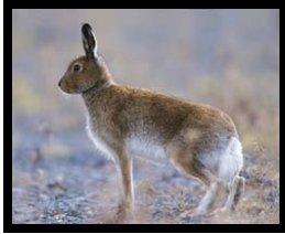
Irish Mountain Hare